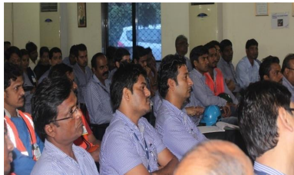
Introductory session presentation on waste & water current scenario/issues