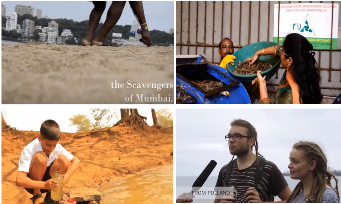
Short-Films screened in the programme

The films showcased in the programme were selected from the short films submitted in Ekconnect Knowledge Foundation short film contest 'Anvaya'.