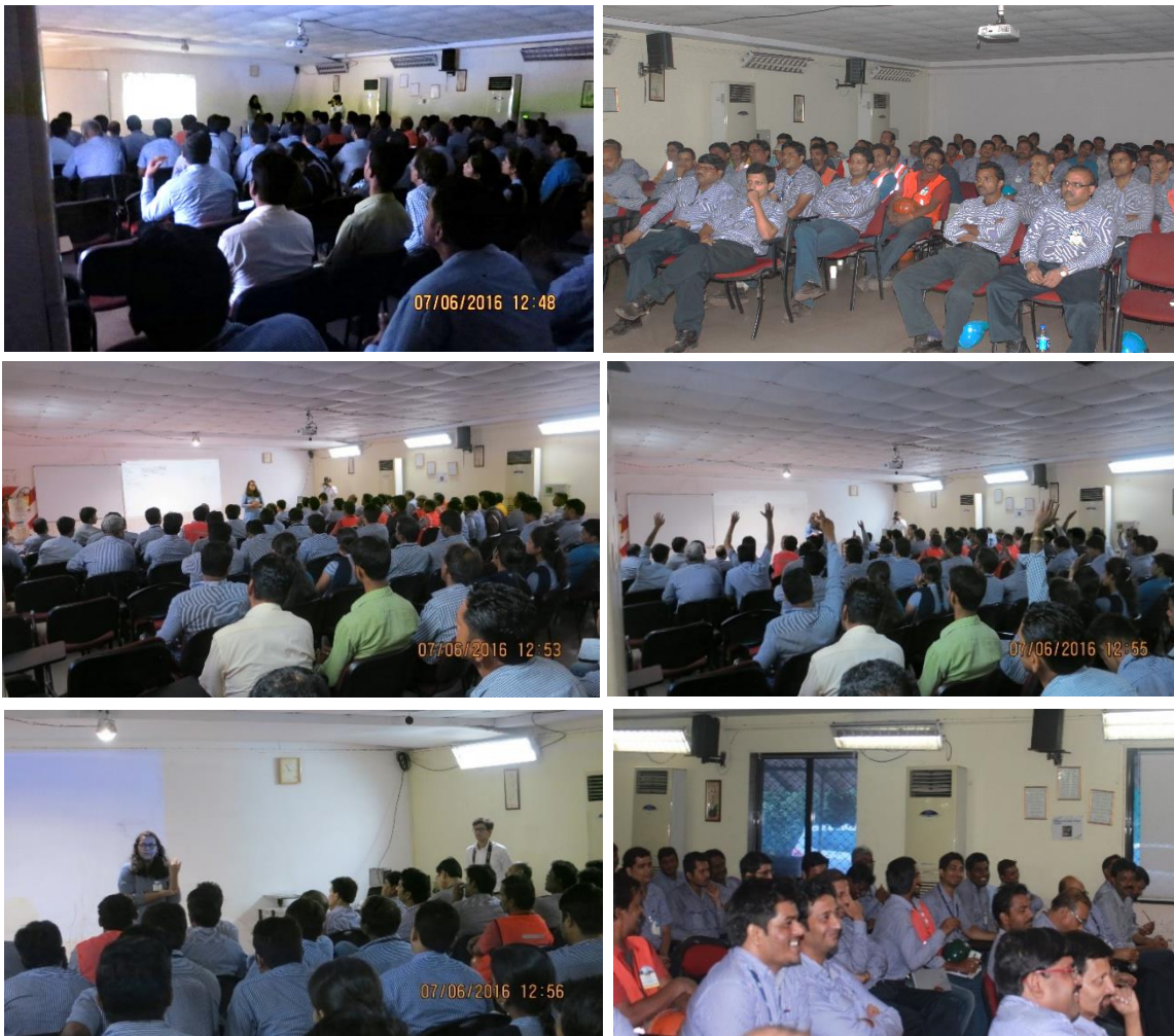
Film Screening & Interactive sessions

Shortly, two films on Water Management were screened viz; PAANI by Pulp Reels and Water is Life both made in Marathi with subtitles suitable for general public. The films highlighted the importance of Water as a natural resource and also explained different ways on how we can save water in our daily life. The participants interacted throughout the screening and requested us to screen these films in their canteens and nearby villages so that other people also get sensitized on the critical issue of Water Management