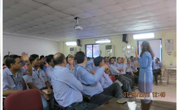
Q & A session