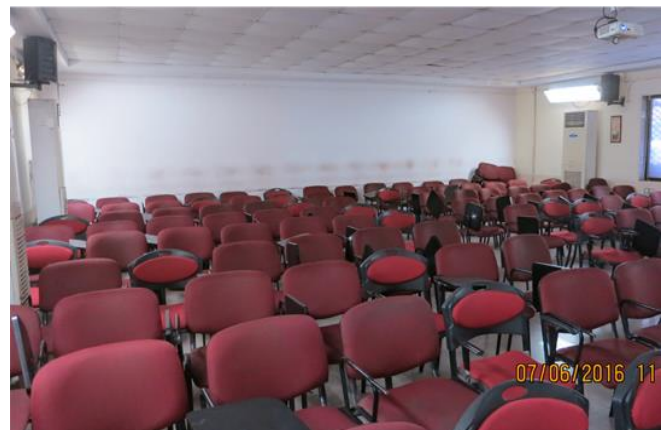
Venue: JSW, Dolvi Training Hall